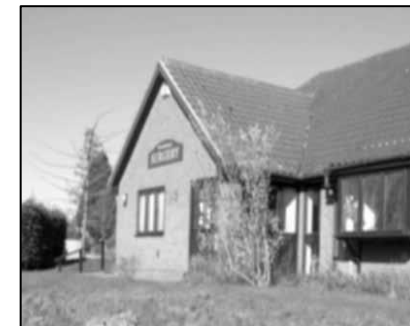
Woolsthorpe Surgery Woolsthorpe by Belvoir NG32 1LX