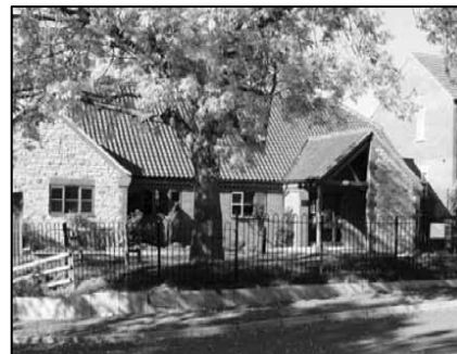
Stackyard Surgery Croxton Kerrial NG32 1QS